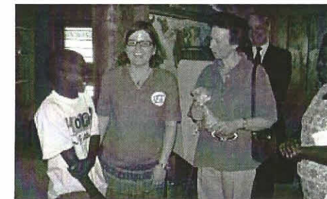
Presenting HRH Princess Anne with our gifts

We have been privileged to have some high profile visitors this year. Ban Ki-moon, Secretary-General of the United Nations, visited on my first official day of work and HRH Princess Anne came in September as part of her Golden Jubilee tour of Zambia. She took