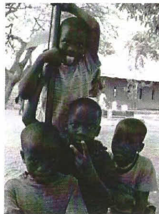
A group of 8-9 year old boys who visit the library every day

Things I took for granted in the UK have been challenged since I arrived in Zambia: collecting data on library use/book borrowing without a circulation system (books are reference only and we don't have library access to the online library management system yet); assumptions about how and why the library is used (young children do not arrive with their parents, they come alone; girls cannot always come to the library after school because they have to go straight home, while boys have more freedom); the way that programmes and activities take place (the Zambian sense of time means that programmes running in the library can take place at pretty much any time on the day they are scheduled, and sometimes on a