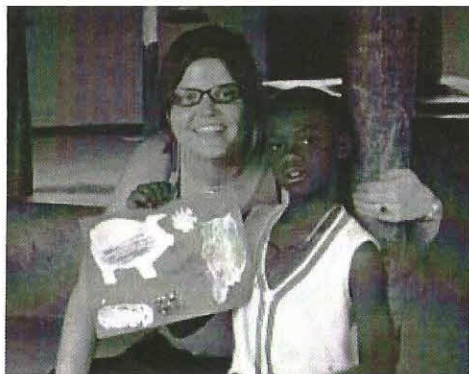
A finished collage

For more information about Fountain of Hope: www.fountainofhope.org.uk