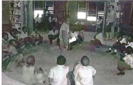
Children using the Talking Circle in the middle of the Reading Room

As a result, those who stay on the streets near the Centre all know me by name and I often get odd looks from strangers when I am walking home from work and have to stop and greet the youngsters who are begging at the traffic lights! It is humbling and often upsetting working with these young people though, and their stories are traumatic. The first time I was taken into the local Compound (informal housing settlement) I kept thinking of the documentaries that I had seen on the TV, where a celebrity is taken around a slum, and suddenly realised with a jolt that it wasn't just something on the telly, it was real life.