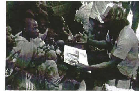
Red Linso, a popular musician, reads to the young people who stay on the streets at the City Market

different day!). Even things like general security (I now have a bunch of keys for each cupboard that makes me feel like a jailor) and going to the toilet (yes, a key for that too!) took a little bit of getting used to. Lubuto encourages us to question every assumption that we make about Western libraries so that we can understand our unique clientele and focus on the most vulnerable children. So in some respects I feel like a toddler who is learning to walk for the first time, but I am starting to be able to utilise my skills.