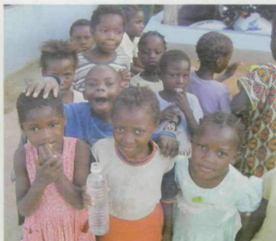
The children of Bwafwano